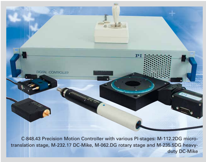
C-848.43 Precision Motion Controller with various PI-stages: M-112.2DG micro-translation stage, M-232.17 DC-Mike, M-062.DG rotary stage and M-235.5DG heavy-duty DC-Mike