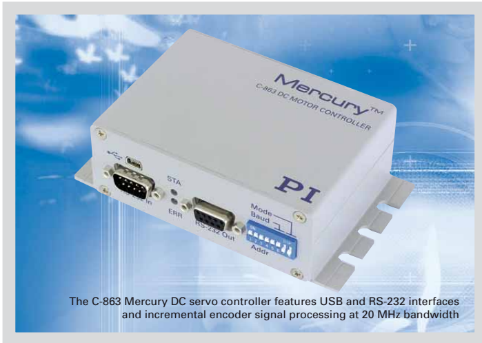
The C-863 Mercury DC servo controller features USB and RS-232 interfaces and incremental encoder signal processing at 20 MHz bandwidth