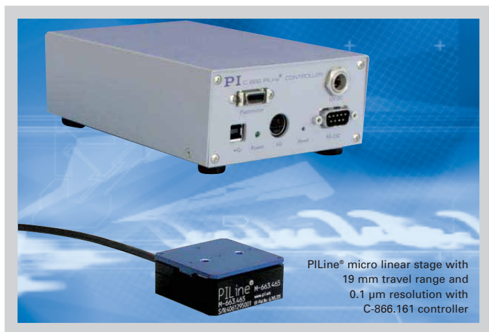
PLine® micro linear stage with 19 mm travel range and 0.1 µm resolution with C-866.161 controller