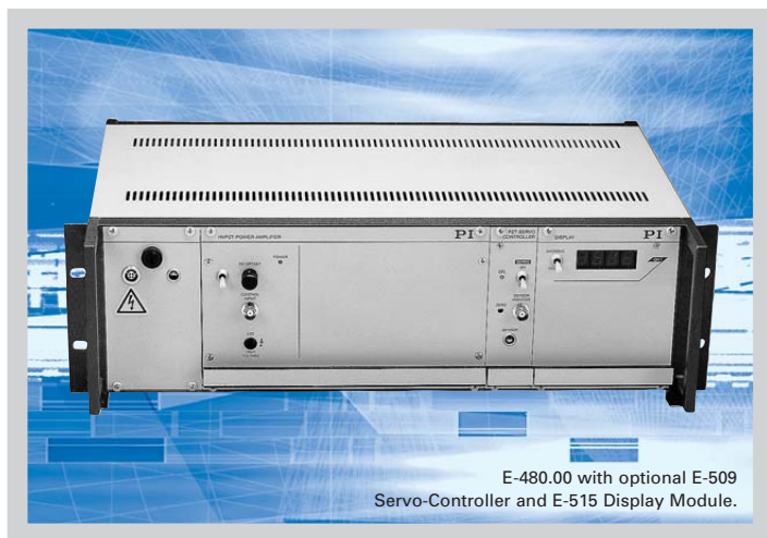
E-480.00 with optional E-509 Servo-Controller and E-515 Display Module.