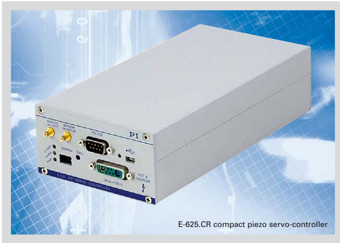
E-625.CR compact piezo servo-controller