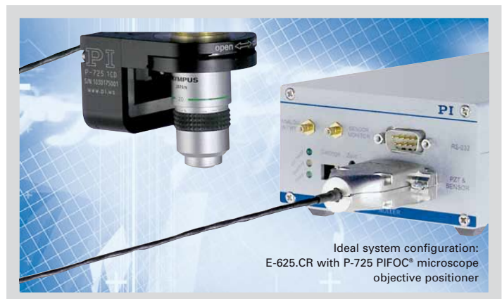
Ideal system configuration: E-625.CR with P-725 PIFOC® microscope objective positioner