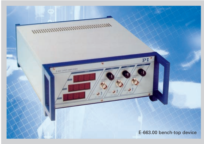
E-663.00 bench-top device