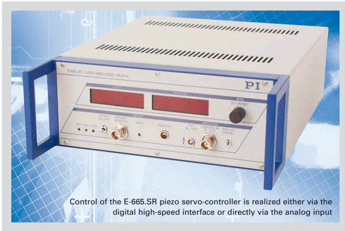
Control of the E-665.SR piezo servo-controller is realized either via the digital high-speed interface or directly via the analog input