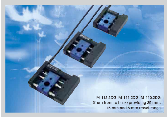
M-112.2DG, M-111.2DG, M-110.2DG (from front to back) providing 25 mm, 15 mm and 5 mm travel range