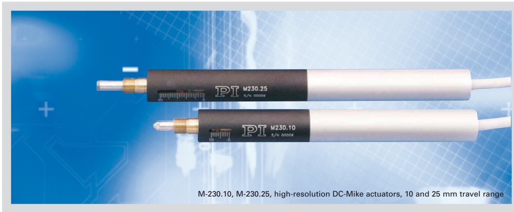
M-230.10, M-230.25, high-resolution DC-Mike actuators, 10 and 25 mm travel range