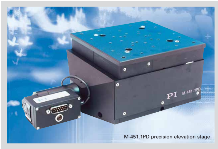
M-451.1PD precision elevation stage