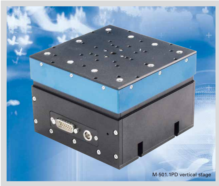
M-501.1PD vertical stage