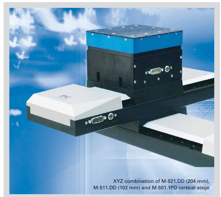
XYZ combination of M-521.DD (204 mm), M-511.DD (102 mm) and M-501.1PD vertical stage