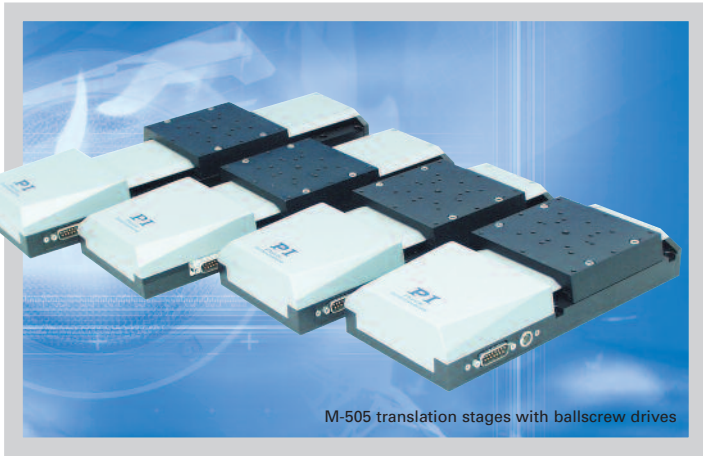
M-505 translation stages with ballscrew drives