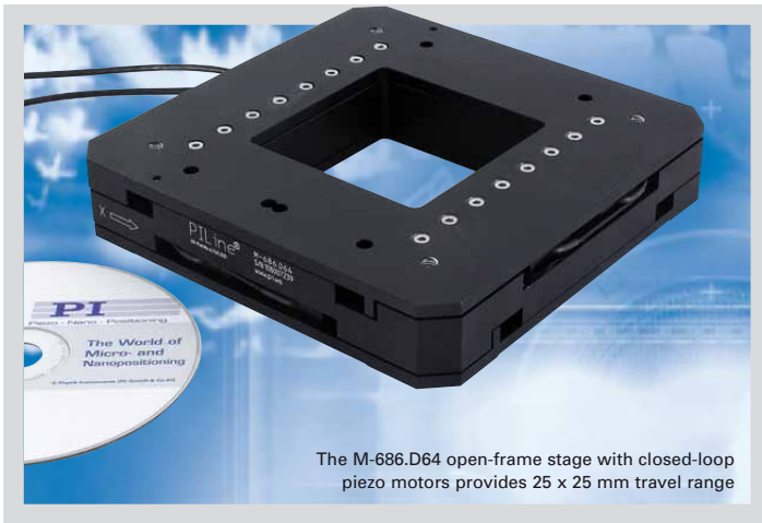
The M-686.D64 open-frame stage with closed-loop piezo motors provides 25 x 25 mm travel range