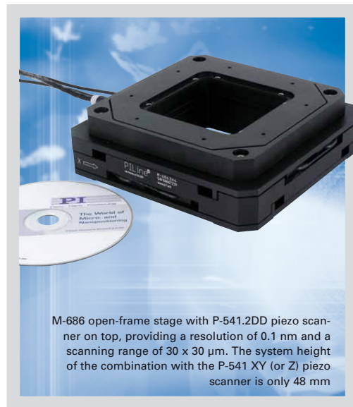
M-686 open-frame stage with P-541.2DD piezo scanner on top, providing a resolution of 0.1 nm and a scanning range of 30 x 30 \mu\text{m} . The system height of the combination with the P-541 XY (or Z) piezo scanner is only 48 mm