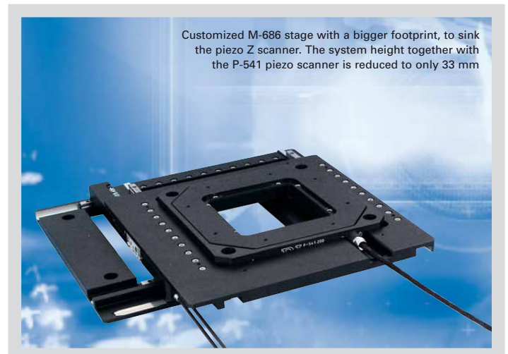
Customized M-686 stage with a bigger footprint, to sink the piezo Z scanner. The system height together with the P-541 piezo scanner is reduced to only 33 mm

P-541.Z Low-profile Z/tip/tilt piezo nanopositioning stages for microscopy