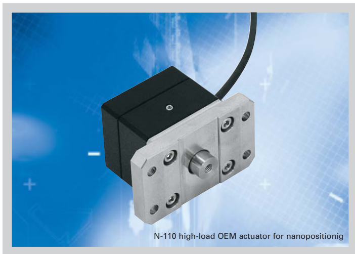
N-110 high-load OEM actuator for nanopositioning