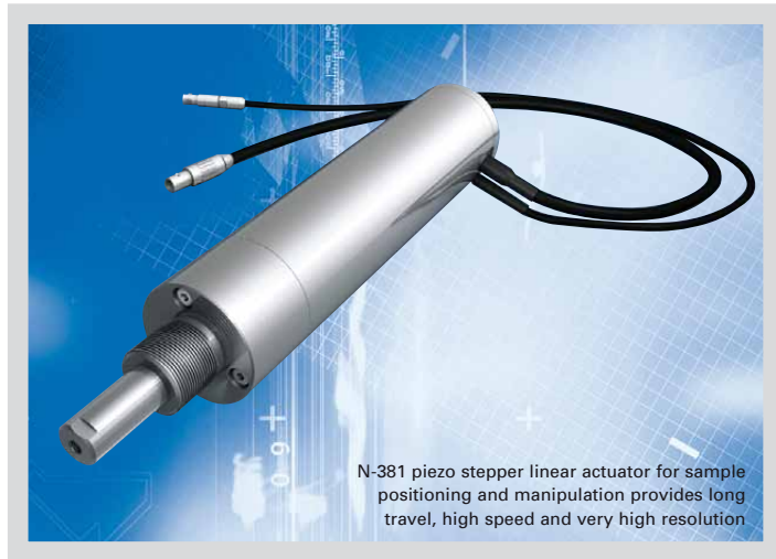
N-381 piezo stepper linear actuator for sample positioning and manipulation provides long travel, high speed and very high resolution