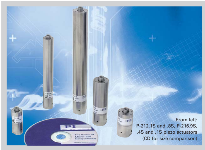
From left: P-212.1S and .8S, P-216.9S, .4S and .1S piezo actuators (CD for size comparison)