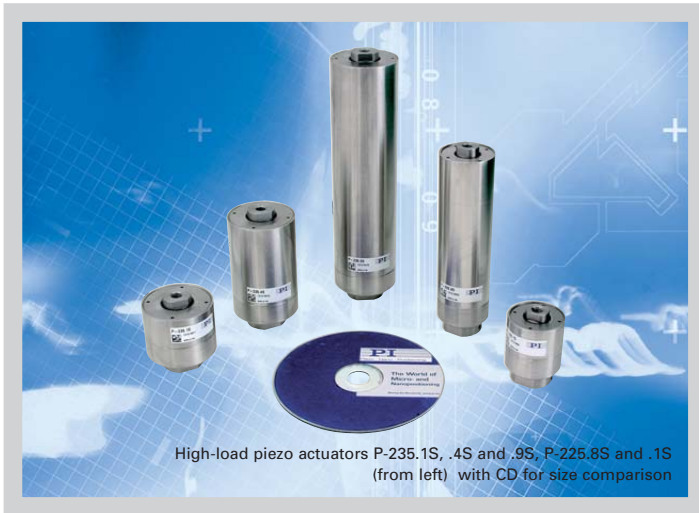
High-load piezo actuators P-235.1S, .4S and .9S, P-225.8S and .1S (from left) with CD for size comparison