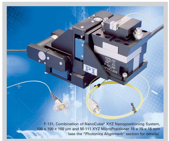
F-131, Combination of NanoCube® XYZ Nanopositioning System, 100 x 100 x 100 µm and M-111 XYZ MicroPositioner 15 x 15 x 15 mm (see the "Photonics Alignment" section for details).

See the "Selection Guide" on p. 2-14 ff. for comparison with other nanopositioning systems.