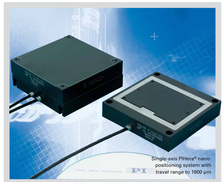
Single-axis PIHera® nanopositioning system with travel range to 1800 µm

Open-loop versions are available as P-62x.20L. Vacuum versions to 10 -3 hPa are available as P-62x.2UD.