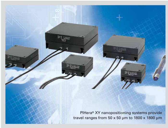
PIHera® XY nanopositioning systems provide travel ranges from 50 x 50 µm to 1800 x 1800 µm