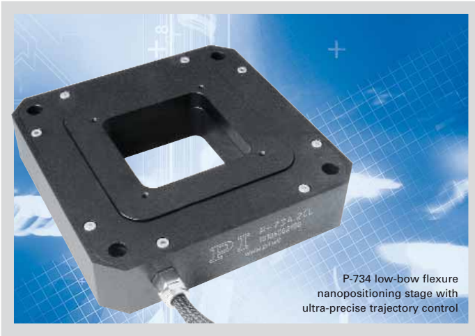
P-734 low-bow flexure nanopositioning stage with ultra-precise trajectory control