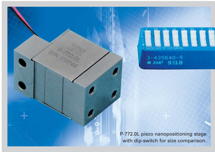
P-772.0L piezo nanopositioning stage with dip-switch for size comparison.