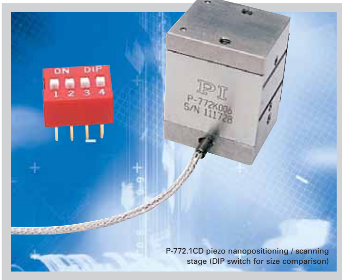
P-772.1CD piezo nanostage / scanning stage (DIP switch for size comparison)