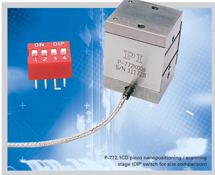
P-772.1CD piezo nanostage / scanning stage (DIP switch for size comparison)