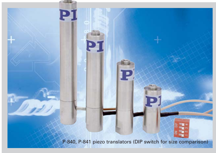
P-840, P-841 piezo translators (DIP switch for size comparison)