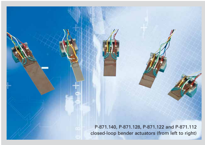
P-871.140, P-871.128, P-871.122 and P-871.112 closed-loop bender actuators (from left to right)