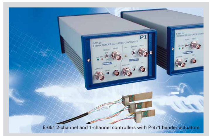
E-651 2-channel and 1-channel controllers with P-871 bender actuators