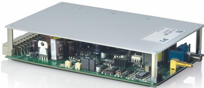
E-617.00F OEM module